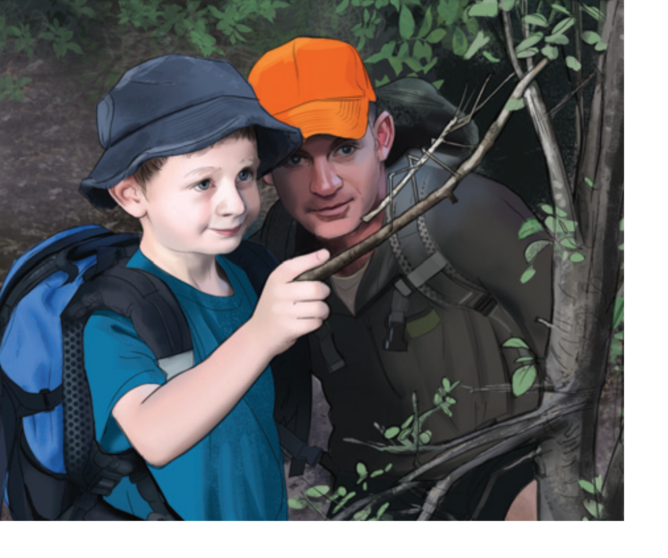
"See, Dad," said Harry. "The stick insect likes to be on the tree."